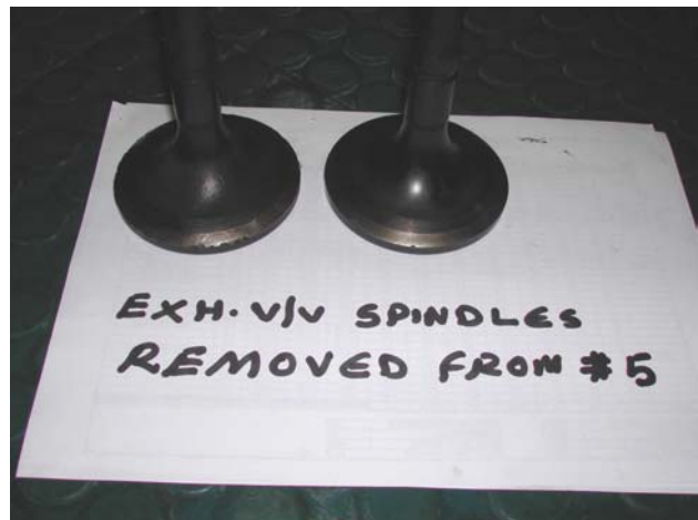
Fig. 3: Exhaust valve spindles