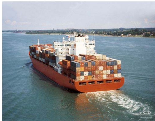
Fig. 1: CP Ships '96- and '95-built 2200 TEU container carriers M/V Canmar Courage and M/V Canmar Fortune – supplied by Korean Daewoo Heavy Industries