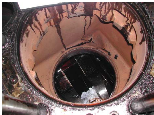
Fig. 9: Cooling water space – liner removed