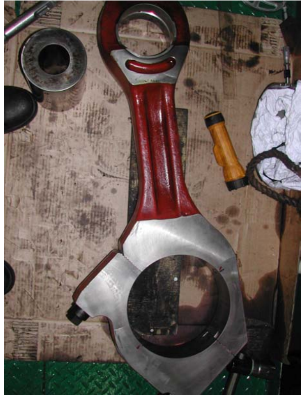
Fig. 14: Connecting rod cleaned and assembled for calibration measurements