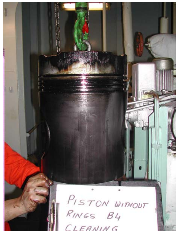
Fig. 5: Piston without rings