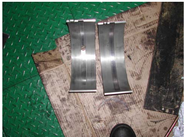
Fig. 15: Connecting rod bottom-end bearing dismantled and cleaned before dye checking.