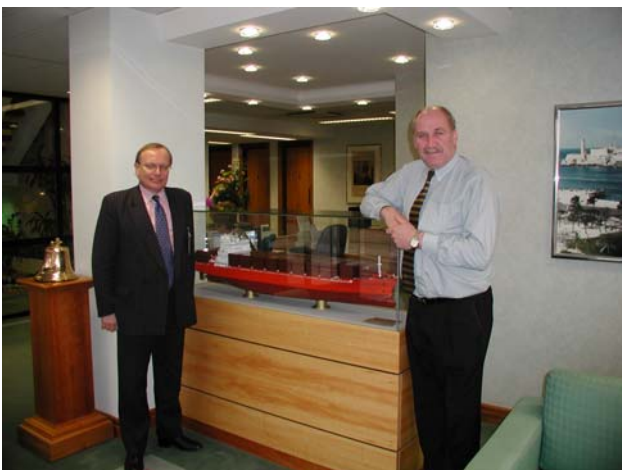
Fig. 17: Pleased with the GenSet situation!

The engines have never been opened up in our period of responsibility, and have been operating without any problems to our satisfaction. When this is said, it has to be mentioned that the camshafts have been changed by MAN B&W Holeby engineers during the guarantee period – since a bad batch of shafts, not sufficiently surface hardened, showed too high wear rates.