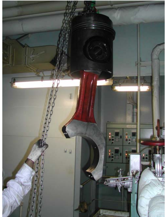
Fig. 7: Piston with new rings ready for installation