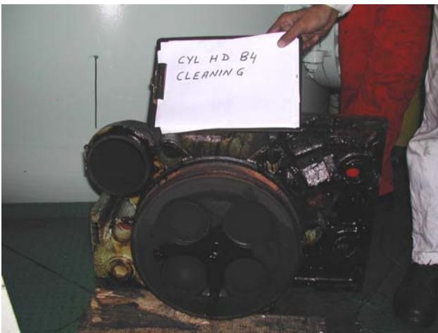
Fig. 2: Cylinder head cleaning