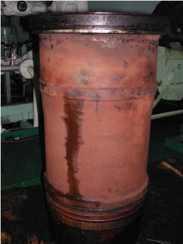
Fig. 10: Cooling water-side of cylinder liner. Cylinder liner O-rings for the cooling water spaces were renewed after inspection and cleaning