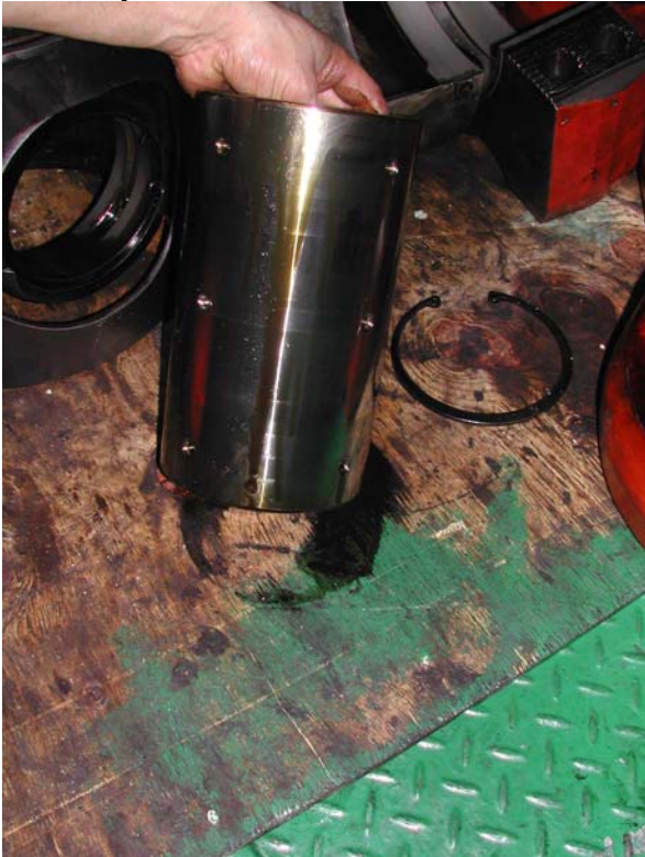
Fig. 13: Piston pin removed for calibration