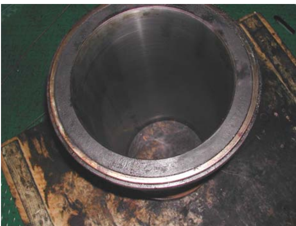
Fig. 11: Cylinder liner after cleaning