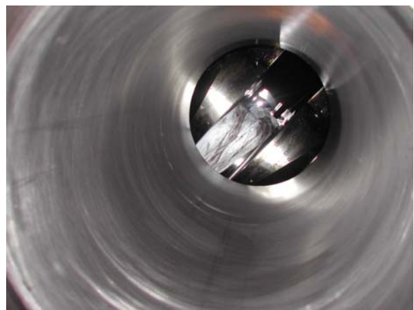
Fig. 12: Cylinder liner after the honing process