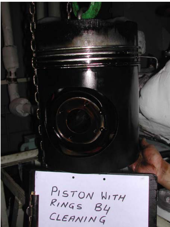
Fig. 4: Piston with rings