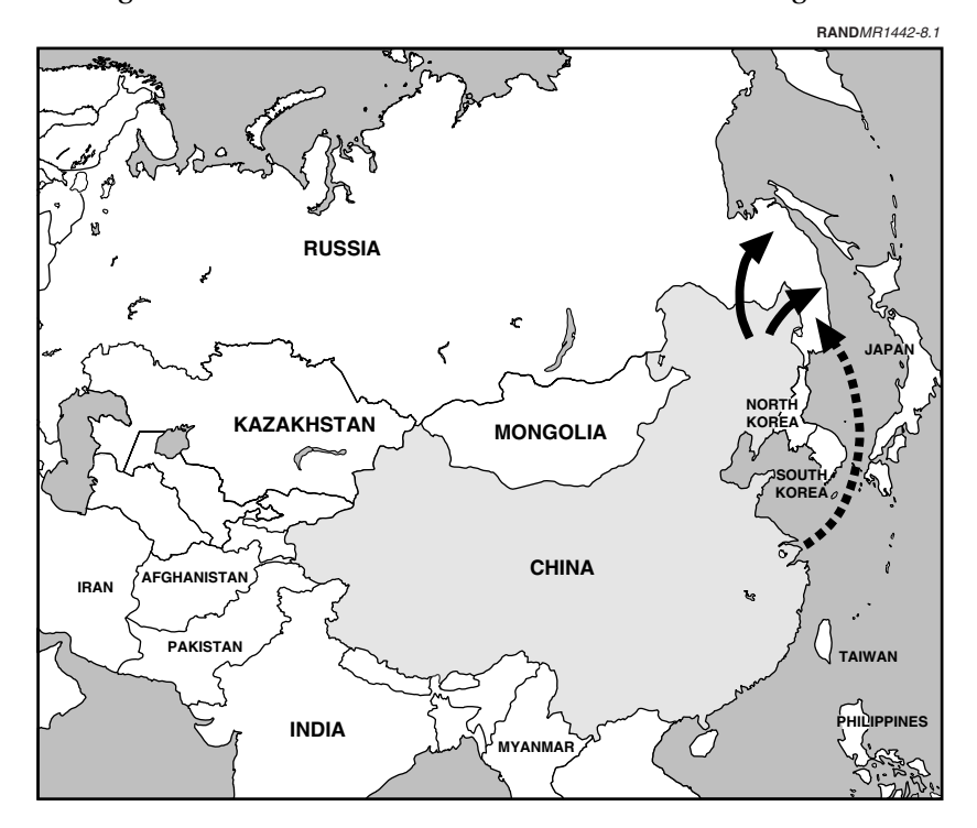
Figure 8.1—Chinese Force Movements

China's strategy for acquiring the territory is based on a plan to provoke Russia into attacking Chinese forces in the region. China, pleading self-defense, could then counterattack into Russia. Beijing, possessing by now a large strategic nuclear force, is confident that Moscow will not risk nuclear war and the destruction of European Russia to defend the poor and underpopulated Far East. The People's Liberation Army (PLA) therefore begins to shift more forces toward the border with Russia. The plan goes awry, however, when Chinese forces get into a firefight with Russian border guards near the border at the Ussuri River. Chinese commanders on the scene seize territory in Primorsky Krai; the weak and disorganized Russian forces in the region are able to put up little resistance. With this fait accompli , Beijing orders its navy to gear up for an amphibious landing at Vladivostok and elsewhere on the coast. See Figure 8.1.