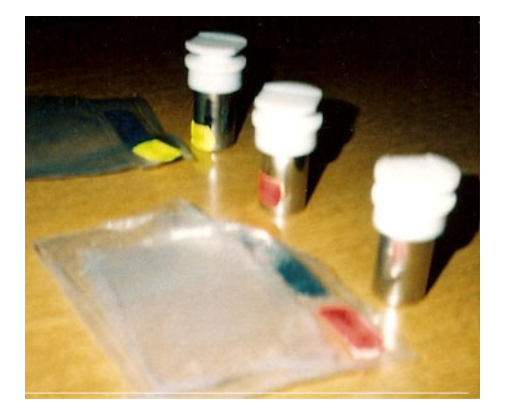
Fig. 1 Sample vessels with A11, A12 and A16 lunar nanoparticles

In Fig. 2, A11 spectrum on Q-DTG curve indicates small inflections near 50 °C long wide peak with the minimum near 100–110 °C and a few other small peaks above 140 °C. For A12 and A16 samples during thermodesorption of n -butanol and water, one long peak was