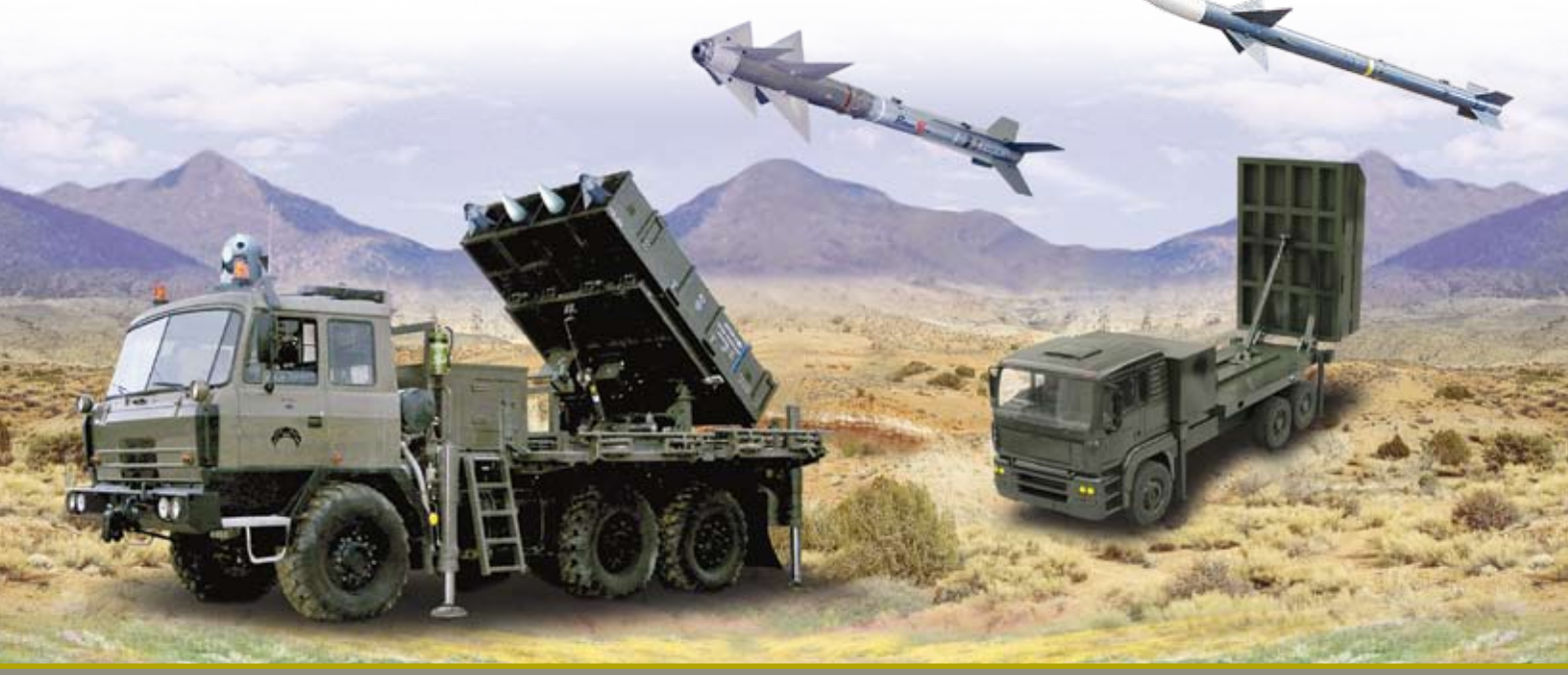
There is no escape from the Spyder's web

Short and Medium Range Mobile Air Defense Systems